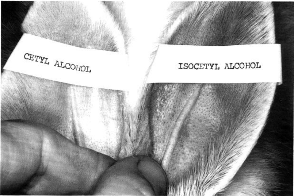
Figure 3. The branched-chain alcohol is more comedogenic and more irritating than the straight-chain alcohol.

As for the miscellaneous items, the usual sunscreen active ingredients are noncomedogenic. Among chemical solvents, acetone, ether, and EGME are not problems, but xylene is comedogenic and an irritant. When metallic bases, such as lithium, magnesium, and zinc stearate, are added to the fatty acids, the metal appears to prevent the comedogenic reaction. Among bases, triethanolamine is more comedogenic than aminomethylpropylamine. The classic formulation of a cold cream often involves a salt bridge between stearic acid and triethanolamine. In testing different ratios [4:1, 1:1, 1:4] of stearic acid to triethanolamine (stearic acid:TEA) in a cold cream base, all combinations were found to be comedogenic.