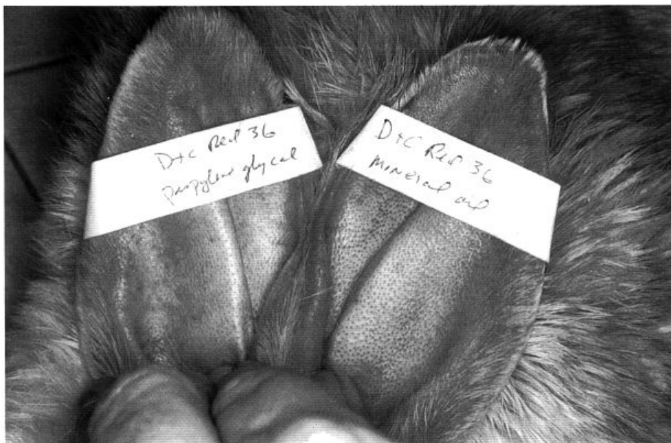
Figure 5. The comedogenicity of D&C red #36 when incorporated into two different vehicles. The vehicle may increase or decrease an ingredient's ability to produce follicular hyperkeratosis.

These studies indicate that skin care preparations that are nonirritating and noncomedogenic can be made. Nonreactive ingredients can be used to make elegant products, and borderline ingredients can be combined with other ingredients to reduce the reactions to acceptable levels. In spite of these guidelines, new formulations must always be examined with the rabbit ear assay before the cosmetic chemist can be assured that his ideas work.