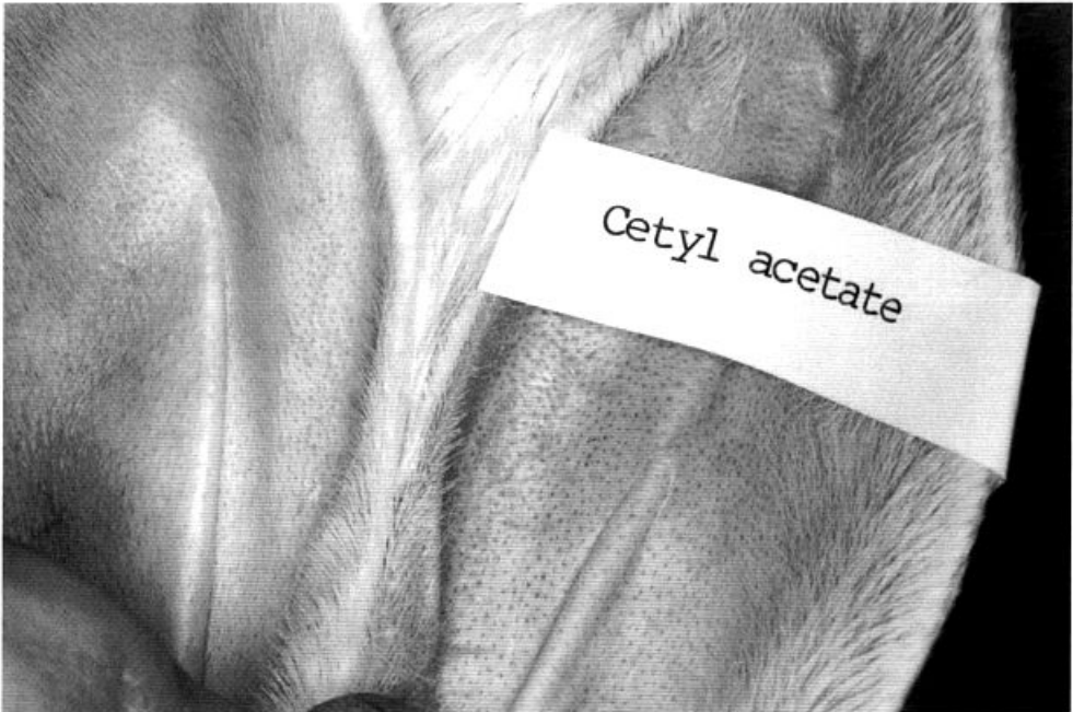
Figure 1. The key ingredient is acetylated lanolin alcohol—cetyl acetate—is not only comedogenic, but it is also an irritant.

Similar analogies are apparent with the alcohols, ethers, glycols, and sugars. Short-chain alcohols do not cause a reaction. The mid-chain-length alcohols are comedogenic and more irritating than their fatty acid analogs (Figure 3). In the glycol series, as the hydrocarbon component becomes more dominant, the compound is more effective at producing comedones. The pure sugars are noncomedogenic. However, if they are combined with penetrating fatty acids, they may become follicular irritants. Also, if they are combined with another irritant, as in glyceryl stearate (SE), which contains added sodium or potassium stearate, the combination becomes more comedogenic. The increasing addition of polyethylene glycols to the fatty acids increases the HLB balance, reduces the follicular irritancy, and appears to prevent hyperkeratosis. An example is the oleth 3, 5, 10, 20 series (Figure 4).