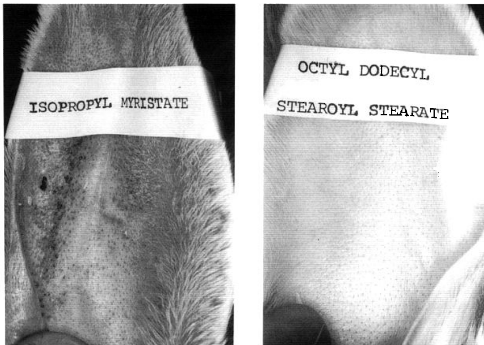
Figure 2. Ingredient testing in the rabbit ear assay—the macroscopic view of the results from testing isopropyl myristate. Microscopic examination confirmed the comedogenicity seen visually. Note that the ingredient is also an irritant compared to a potential substitute, octyl dodecyl stearyl stearate.

hydrogenated vegetable oil (Crisco®) appears to contain residual irritating lipids. Among the natural oils such as sesame oil, avocado oil, and mink oil, the results are improved when a more refined oil is used. However, it seems easier to use safflower oil and sunflower oils, which are naturally less comedogenic. Mineral oil presents a complex problem: some sources are acceptable; others are not.